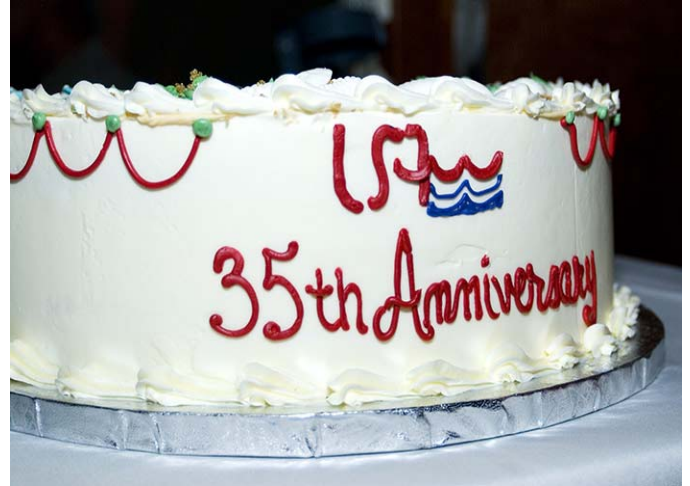
Anniversary Cake from our Holiday Party

Submit your photos for the Page One Shot to newsletter@usadiveclub.com